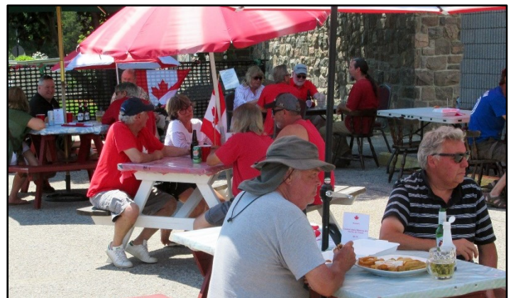
The outdoor patio set-up in the parking lot at the branch has been a popular spot in past weeks, even with social distancing rules and other preventative measures.