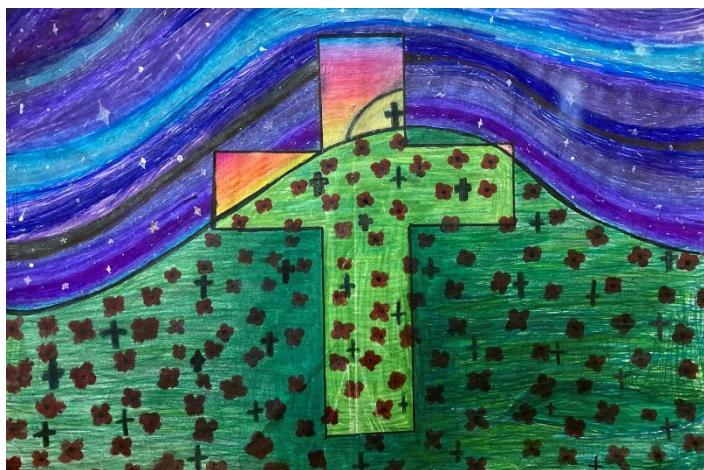
Grade 8 student Elvie Laughlin's submission (above) placed 1 st in the Intermediate – Colour poster category.