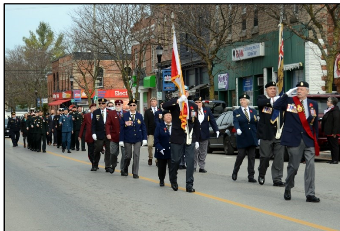
The Branch Colour Party led the parade on Remembrance Day in Coldwater.

Additionally you may give your name to any Executive member should you not be able to contact me using the above means. Hope to see you there.