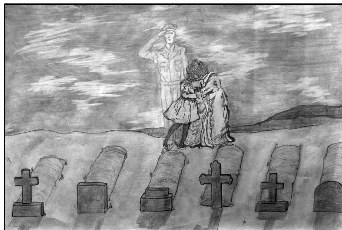
Grade 8 student Kala Uytenbogaart-Payne's submission (above) placed 1 st in the Intermediate – Black & White poster category.