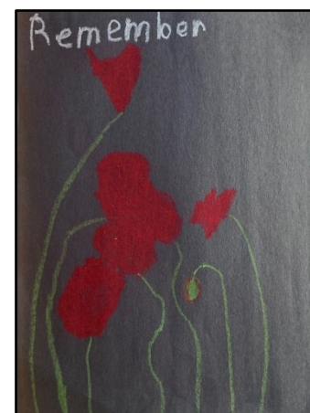
Grade 1 student Ezra Grant's submission (right) placed 1 st in the Primary – Colour poster category.