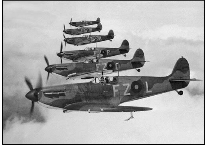
The legendary fighter aircraft Spitfire became the symbol of British resistance against German air forces during the Battle of Britain in the Second World War.

relatively small group of pilots and airmen from Commonwealth and Allied countries, including Canada, turned the tide on Hitler's plan for the invasion of Great Britain.