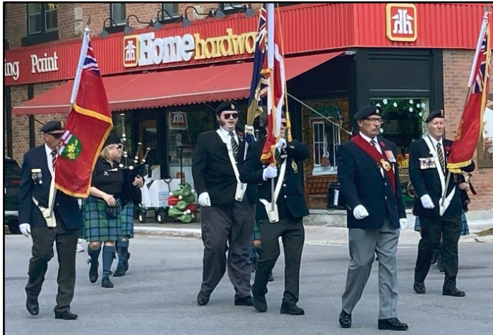
A Branch Colour Party leads the parade on opening day.

branch270@rogers.com • www.coldwaterlegion.com • www.facebook.com/Coldwaterlegion