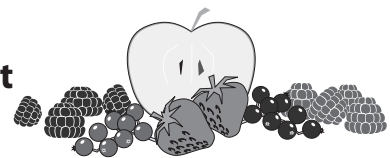
Photo Image Cakes